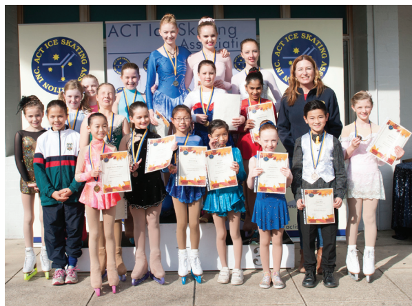
Caption: Aussie Skate awardees at the 2016 Autumn Trophy competition with the ACT Minister for Sports and Recreation.

ACTISA membership, at Aussie Skate level, entitles skaters of all ages to enter figure skating competitions organised by ACTISA or interstate Skating Associations, if they wish.